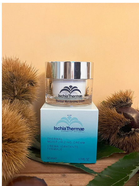
Crema per le rughe termale