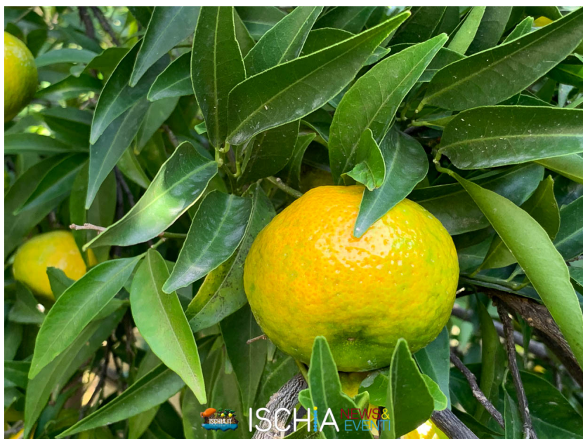
Mandarini Bio Ischia